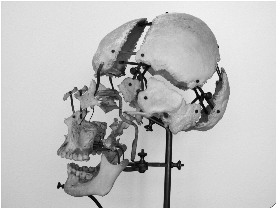
Fig. 1. Lateral view of a human exploded skull.

historic human societies. The study of these skeletons permits direct observation of the way of life of past populations (bioarchaeology) because each individual can reveal a lot of information: signs of diseases, marks of violence or cannibalism, growth and maturation markers, body proportions and adult stature, sexual dimorphism, bone markers of muscular activities or postural markers, markers of social stratification, aesthetics markers, dental wear, tooth decay and micro-traces, stable isotopes of carbon and nitrogen related to the eco-environment and diet, trace elements, paleo-parasitology, paleo-epidemiology and paleo-demography (Froment, 2011). Thanks to the presence of the palethnological materials, all this information can be integrated under a bio-cultural perspective.