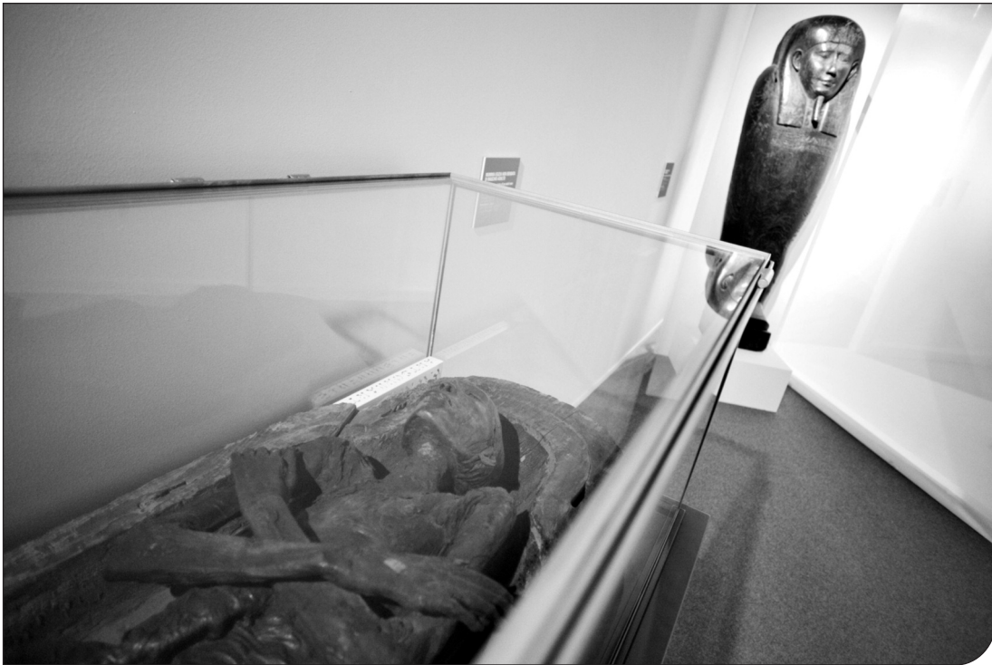
Fig. 3. The mummy and sarcophagus at the exhibition "Faces. The many visages of human history".

study of mummies, both in the past and in the present.