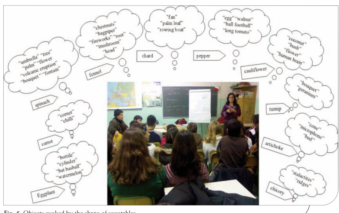
Fig. 5. Objects evoked by the shape of vegetables