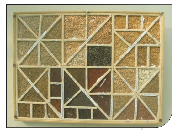
Fig. 1. Seed case.

For educational activities performed out in schools of Tricase (Lecce), the collections have been brought out the Botanic Garden, as seeds and vegetables grown and collected in fields-catalog, but also panels, scientific posters and informational materials.