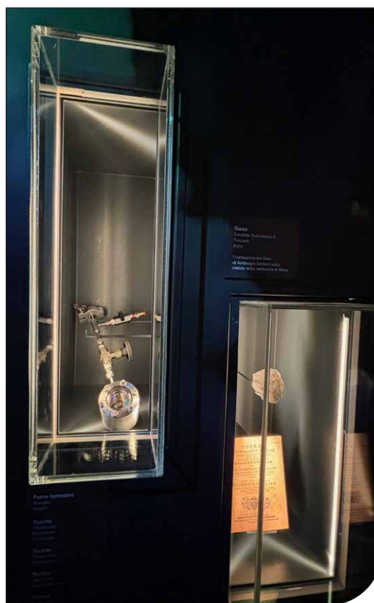
Fig. 2. The Ryugu returned samples within their custom-made container displayed at the Natural History Museum "La Specola".